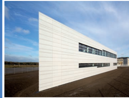
Left & above: Fraunhofer Institute for Ceramic Technologies and Systems IKTS.