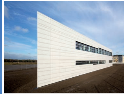
Left & above: Fraunhofer Institute for Ceramic Technologies and Systems IKTS. Below: New construction of lake residence in Potsdam. (left) Town House Linienstraße Berlin-Mitte. (right) Right: Headquarters of Mercedes-Benz Sales Germany in Berlin.